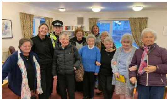
Police Talk on Community Safety