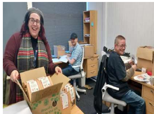
PDP Elves helping with Christmas Newsletters & Activity Packs