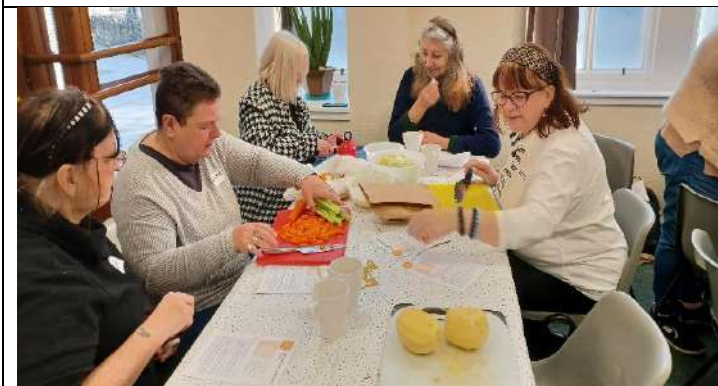
Multicultural CookAlong/ Community Meals