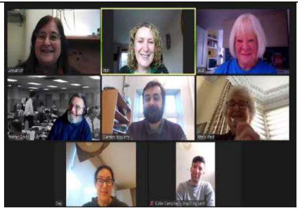
Leith Timebank Advisory Group