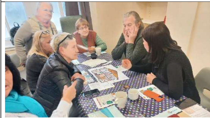
Energy Efficiency Advisory at Cook-Along Group