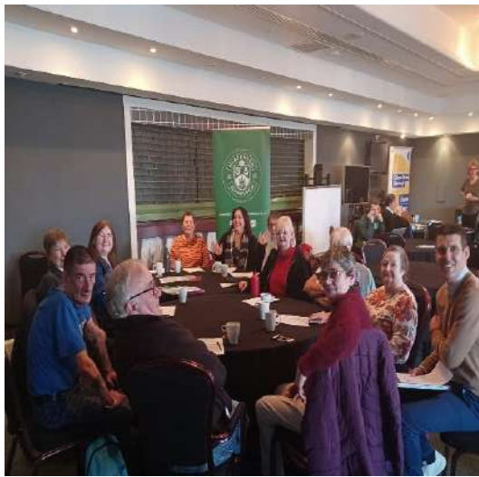
PDP/LTB/ Ageing Well Pilot Project