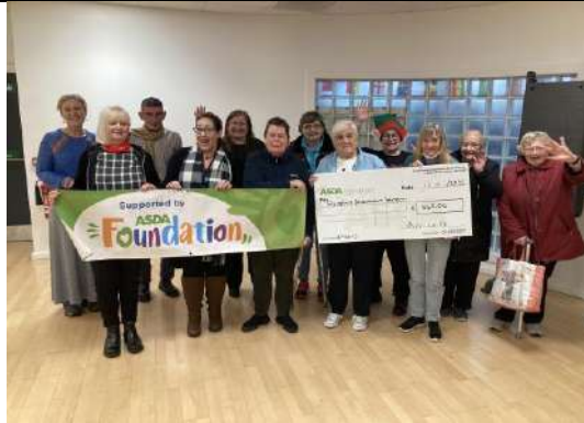
ASDA Cheque presentation