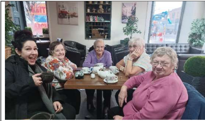
Leith Timebank Afternoon Tea