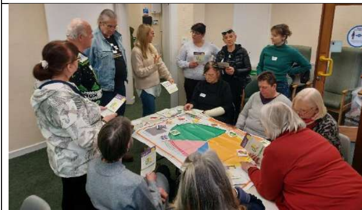
Living Well in Later Life Health Talk