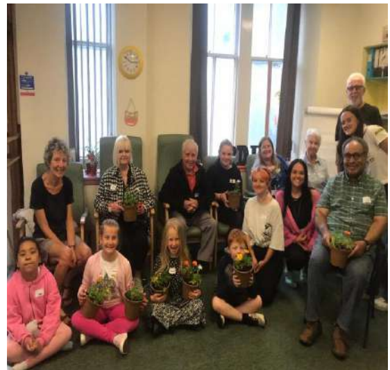
Summer22 Intergenerational Project