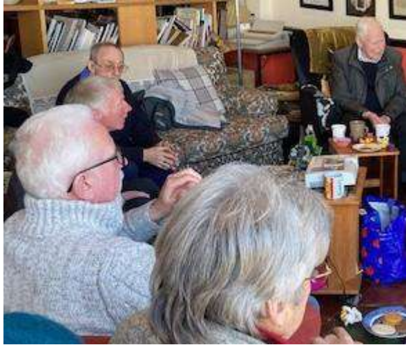
Older Men's Group outing to Living Memory Association