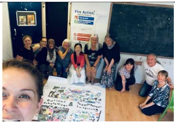
Multicultural Art Wokshop