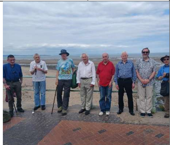
PDP/ LTB/ Ageing Well Reconnecting Project Session at Leith Victoria