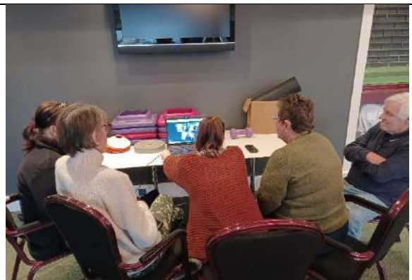
Digital Skills – Learning how to “zoom”