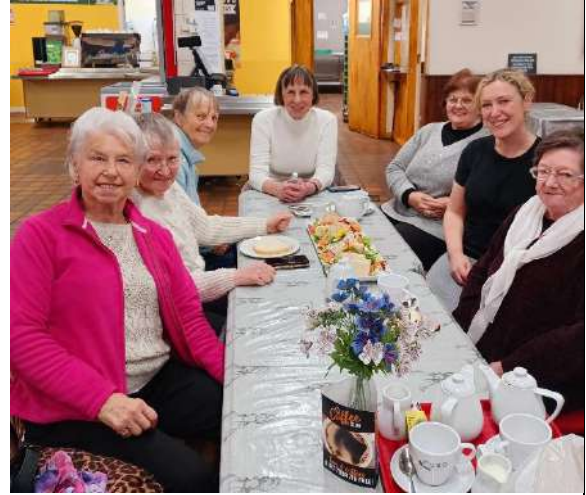
Afternoon Tea with the Women's Group