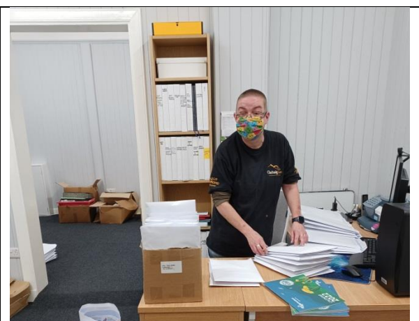
Newsletter/ Activity Pack Volunteer