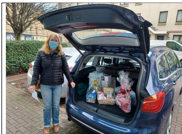
Christmas Delivery Volunteer

“Thank you all for such an amazing experience volunteering at Pilmeny Development Project – it brought me such joy”.