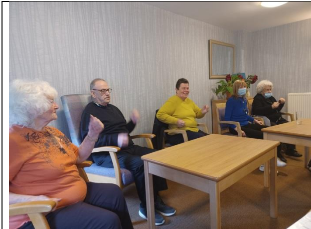
Gentle Seated Exercise