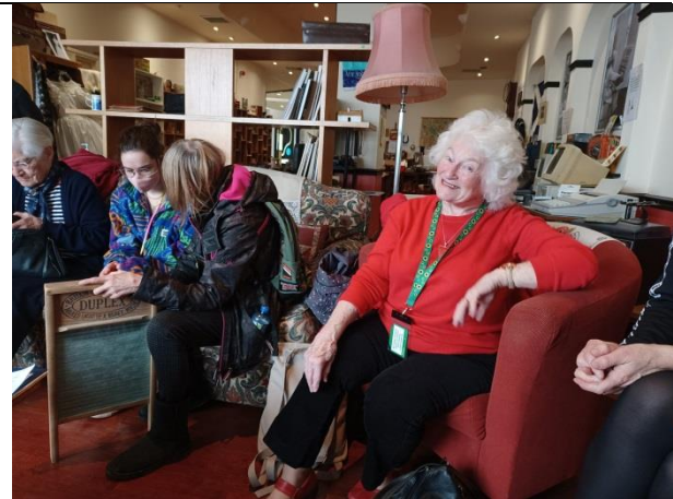
Trip to Living Memory Association

“Won’t know these people, now know 14 new people” “I lived alone previously and never seen anyone from week to week” ‘Camaraderie, togetherness & friendship, group bonding’