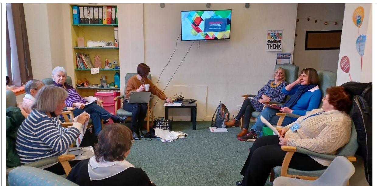
Edinburgh Library Digital Lesson at PDP Women’s Group

“Personally I found it excellent, with sensitivity to our different levels of experience with zoom”